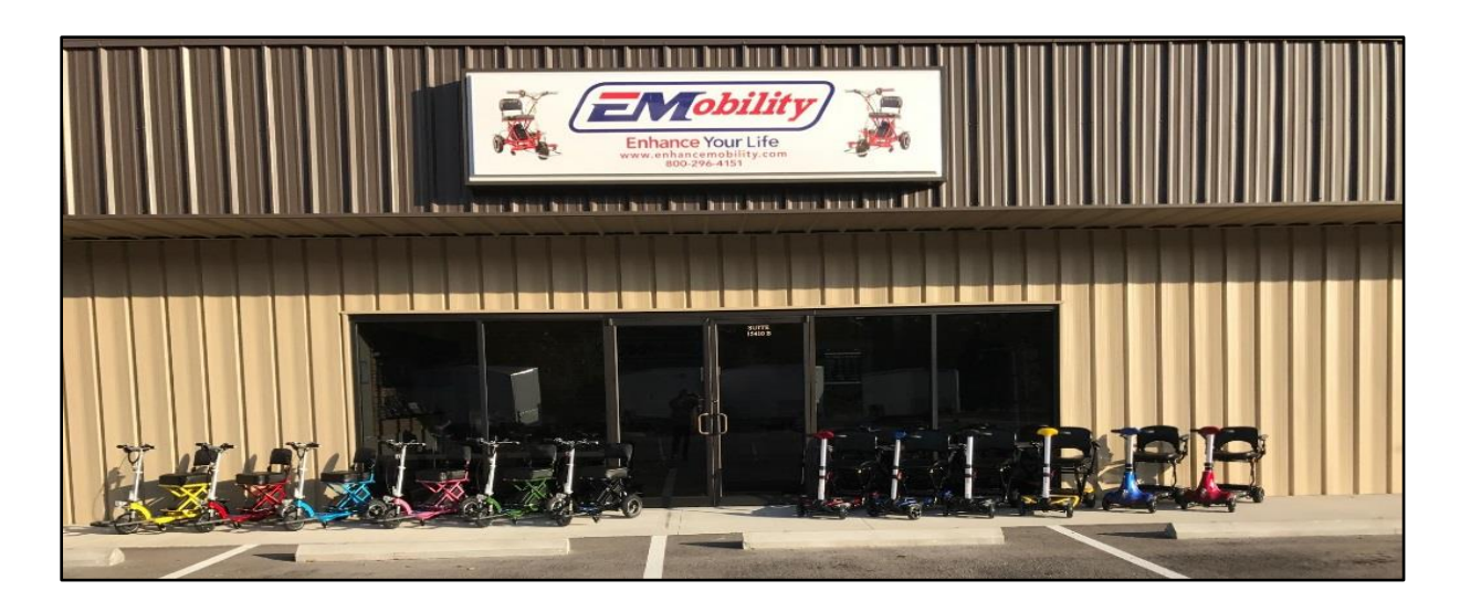
Please Note – all product specifications and colors are subject to change.

To learn more about our dealer program, contact us at 800-296-4151 ext 704 or email <u>sales@enhancemobility.com</u>. Enhance Mobility – Enhance Your Life.