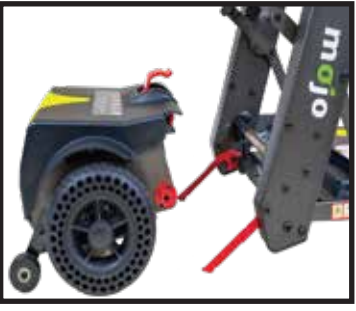
4. Complete. Your MOJO is now fully disassembled.