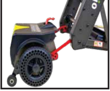
2. Guide the red bars from the frame of the MOJO, over the top of the red tabs on the Rear Transaxle. Slowly lower the frame of the Mojo down into the Rear Transaxle.