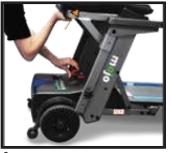
3. While the Axle Release Lever is pulled back, use your other hand to push up on the bottom of the seat, until the frame is fully detached from Rear Transaxle.