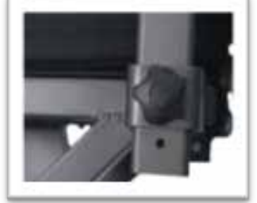
Arm Rest (1)

The basket attaches to the bracket on the front of the tiller. Simply slide the basket into place. The basket can be easily removed and folded for transport and storage.