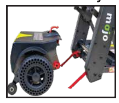
1. To reassemble the MOJO, line up the red tabs on the Rear Transaxle with the red bars on the frame.