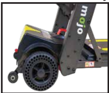
To disassemble the MOJO scooter, locate the red, Axle Group Release Lever in the rear of the scooter.