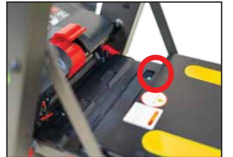
Remote Relay Button