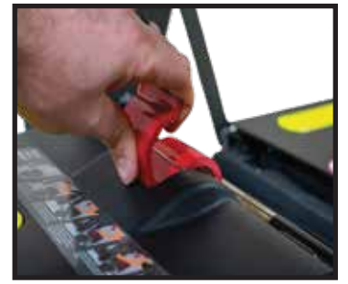
3. Once you have fully lowered the MOJO's frame into the Rear Transaxle, pull out on the red Axle Group Release Lever. The fame will lock into its final position.