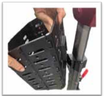
Basket Install (5)