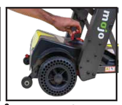
Pull the Axle Group Release Lever backward until the anti-tip wheels rest on the ground. This will detach the Rear Transaxle from the frame.