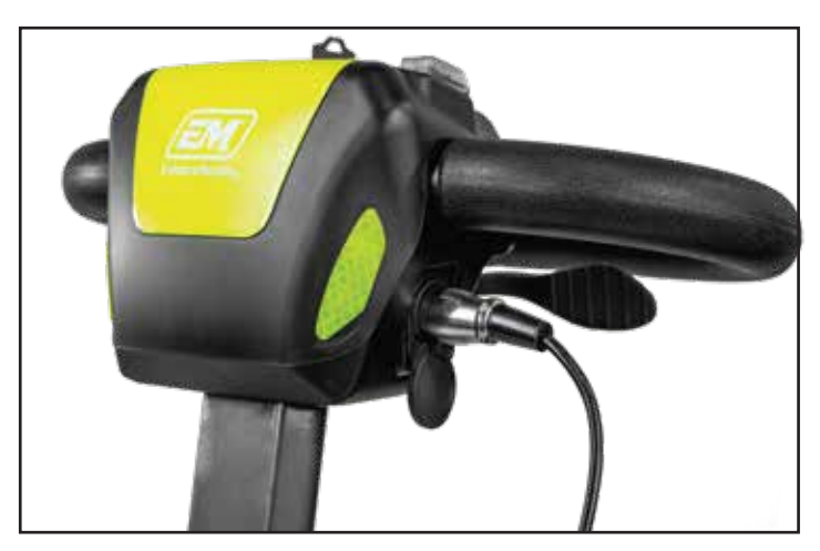
*The battery can be charged out of the scooter using the optional docking station accessory and quick charger