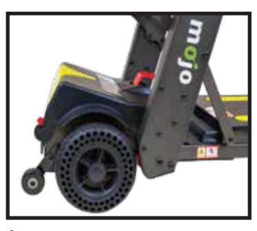
4. Complete. Your MOJO is now fully assembled.