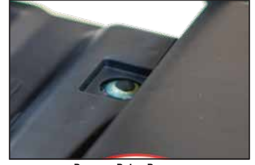
Remote Relay Button